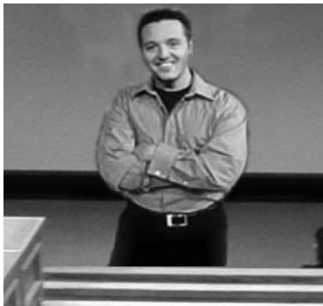
Get it? They have the same name!

This Tuesday, John Edwards visited Carnegie Mellon to tape his hit show "Crossing Over with John Edwards." Students were treated to an exciting show in which Edwards channeled the spirits of several deceased relatives of students and faculty giving them a chance to speak once again with their loved ones.