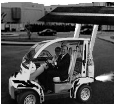
These carts are mildly fast and slowly approaching furious.

Police Chief Doyle announced yesterday that a task force of CMU Police officers had successfully busted an illegal racing ring that was using the campus grounds for their activities. The ring in question was composed of FMS workers who had modified their maintenance carts with aftermarket modifications. "We're just glad that this racing group has been shut down. It was pretty dangerous. Some of those carts had been modified to reach speeds as high as 8 miles per hour," said Chief Doyle.