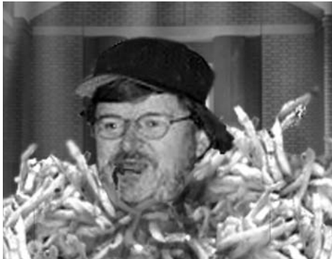
No one told him how big a large is

"We had a similar situation when Fat Albert