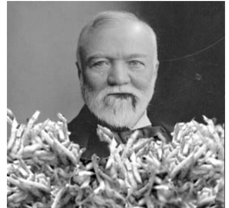
That's only a medium

"You're readme right?" asked Andy. "Cause if so, I'll explain to you why campus food sucks, if you'll tell the world. See how it went down was in like the 1900s or whenever I was king shit of the world, I was real into social Darwinism. I figured kids at my school would be superhuman motherfuckers if the strong kids ate the week kids, cause come on, have you ever seen 'Ravenous'? So yeah, I was talking to Henry Frick about this, and he's like, 'yeah bitch. Make the food at your school suck real bad so eatin' another kid will look awesome.' So I was like yeah, bitch, yeah, and I went out and got a whole bunch of