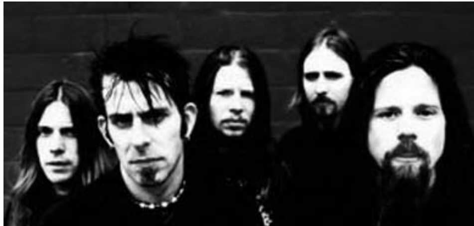
Lamb of God