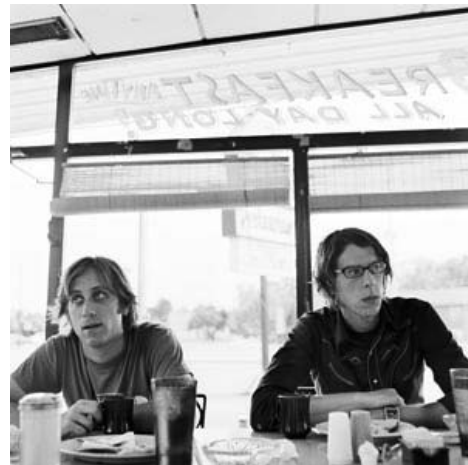
The Black Keys

Horton Heat, because the Cramps bring to mind George Romero, Bettie Page, Cadillacs, and surfboards, among other things, and all at once. What's not to love about songs with titles like "Bikini Girls with Machine Guns," "Aloha from Hell," and "Elvis Fucking Christ!?" Go, be disturbed, and enjoy.