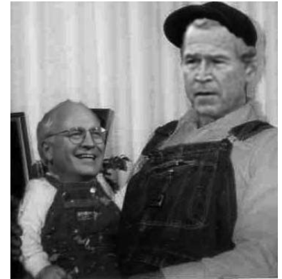
He can do it with water too!

This week, President Bush announced that he's "scared" of the Oakland university community "like a hound dog's afraid of a porcupine" or whatever that means. This wasn't a huge surprise given that the signs were obvious. John Kerry was a Pitt last semester. John Edwards was here last week, and even Michael Moore was scheduled to be on campus this week. But no sign of the Bush administration.