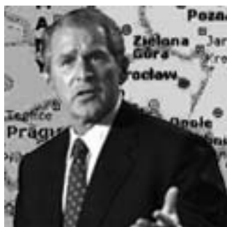
He talks to these people every day. He knows how they think.

a candidate for president denigrates the contributions of these brave soldiers. It's ludicrous. The Polish Special Forces are single-handedly responsible for replacing every light bulb in our command centers. Sure it takes them a