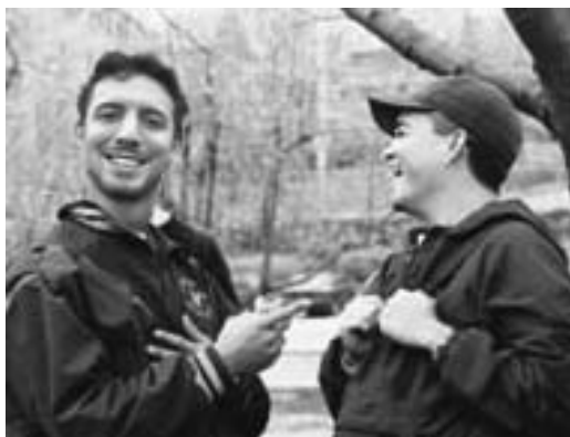
There's no girl in this picture

The Carnegie Mellon community is once again gearing up for Homecoming, a large, well-publicized series of events which few or no current students will hear or care about. Most students know that Homecoming is probably, or possibly, or maybe, one of the most important games of the season for the football team here. However, the weekend is also full of events such as movies, dinners, and seminars, which are all geared towards the returning alumni. These events are ways for alumni to keep in touch with the campus, but often hold little appeal for current students engaged with midterms and campus life.